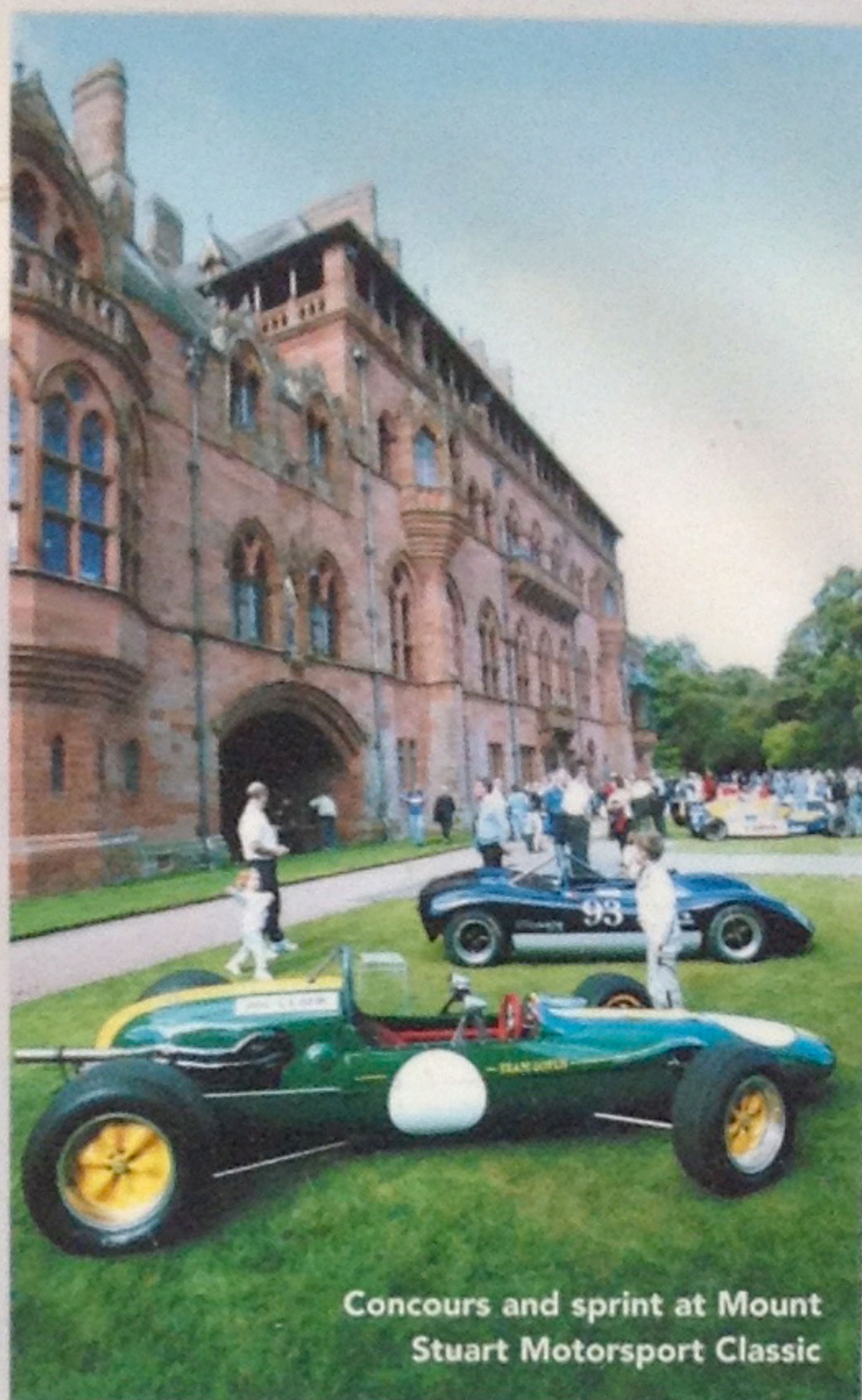
Concours and sprint at Mount Stuart Motorsport Classic

Following the huge success of the inaugural event last year, the Mount Stuart Motorsport Classic has been made an annual fixture – and Classic & Sports Car is supporting the Sunday concours. The September 19-21 motoring festival is held in the grounds of the ancestral home of the Marquis of Bute, Scotland, better known as former racing driver Johnny Dumfries. Our sister magazine, Motor Sport , is supporting the Saturday Rallysprint. Tickets cost £10 per day, with under-16s £6 and free entry for children under six. A family ticket is also available for two adults and two children at £25 per day. Call the Tourist Information Centre to order, on 08707 200619. Car and passenger ferries cross to the Isle from Wemyss Bay, north of Largs, to Rothesay, and from Colintrave to Rhubodach in the north of the island – and there's also a dedicated return cruise service from Glasgow's Waverley Terminal on Saturday and Sunday. The Balmoral Cruise package includes transfer from Rothesay pier to Mount Stuart and entry to the event for £29.50. To book a place, call 0845 1304647.