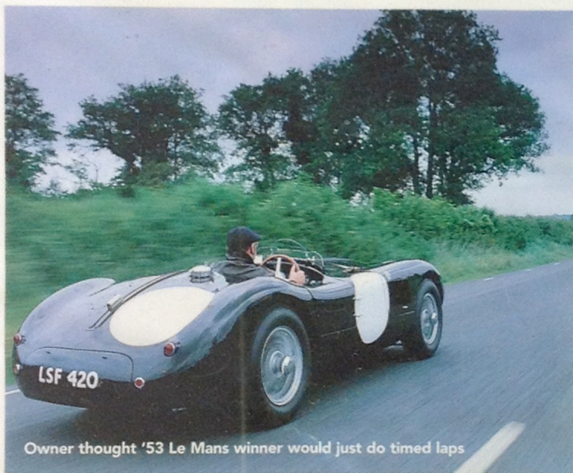
Owner thought '53 Le Mans winner would just do timed laps